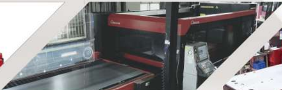
4000W CO2 laser cutting machine