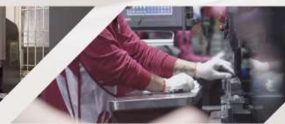
CNC bending processing