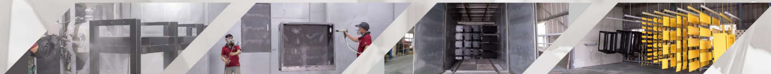
STEP1 Sand blasting