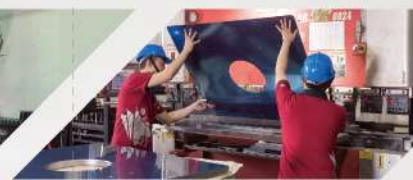
bending press processing