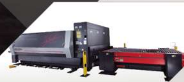
3000W fiber laser machine