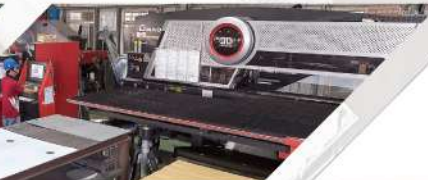
EML3610NT punching laser complex machine