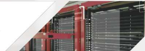
6 sheet metal automated storage equipment