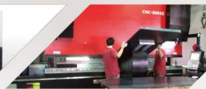
Toong-Woei CNC-30042 4m2 bending pressing machine