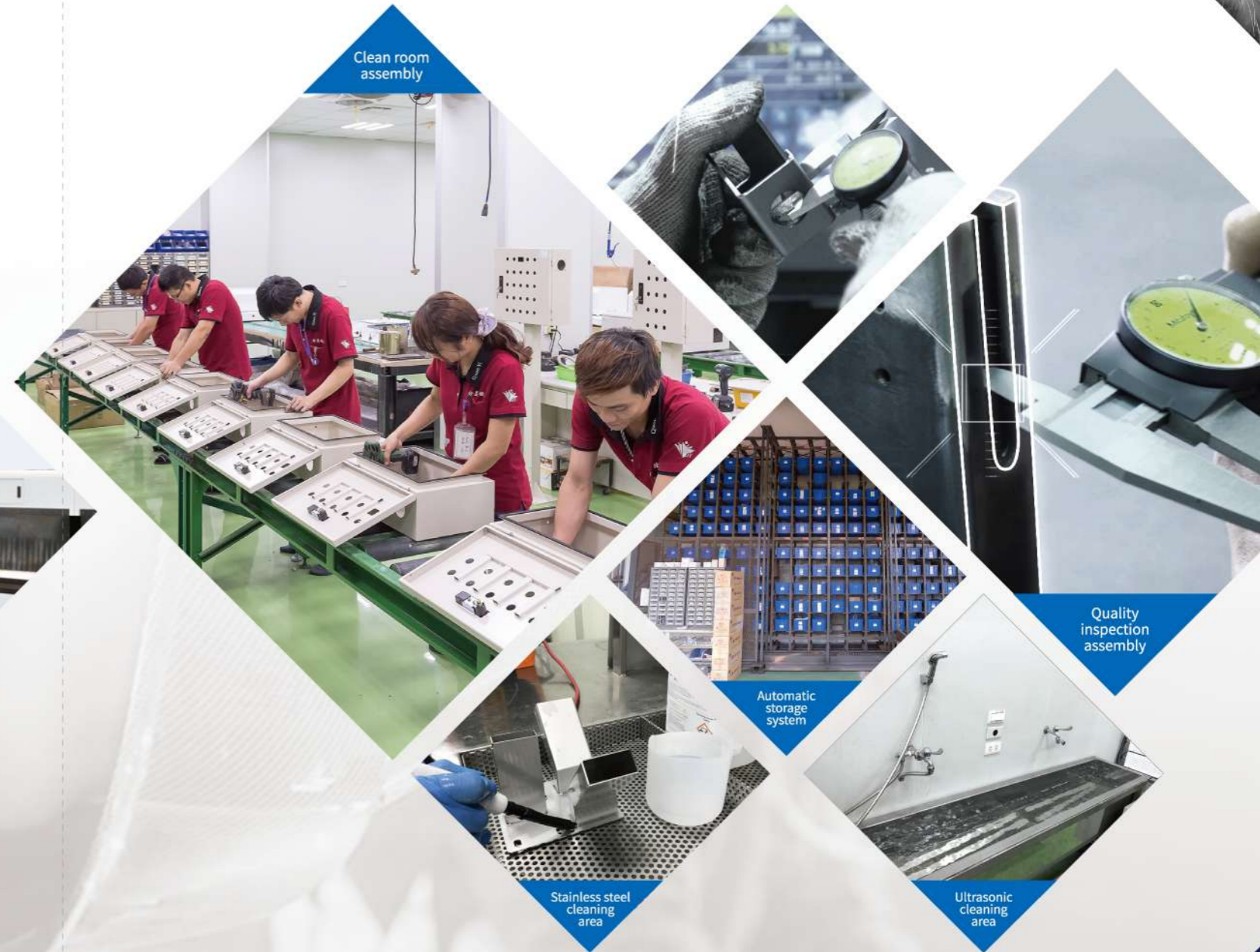
Clean room assembly