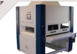
Japanese ST-Link deburring machine