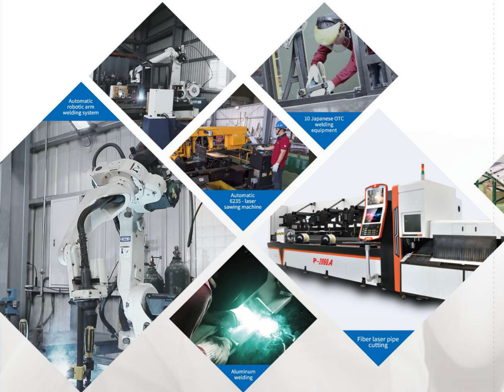
Automatic robotic arm welding system