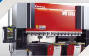
AMADA-HG13031 and AMADA bending press machine